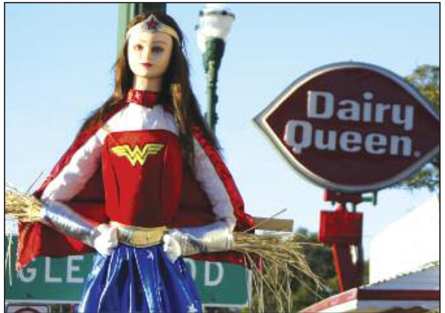
Let the creative juices flow and build a scarecrow that delights, terrifies or amazes the crowds.

Wayne Main Street will host a Contest and Reception at 7:30 p.m. on Oct. 15th in Goudy Park. Please help us welcome the Scarecrows to our community by picking up a ballot at the park and then taking a self-paced walking tour through our downtown. After you've viewed all of the entries, rejoin us at our Downtown Reception to cast your vote for