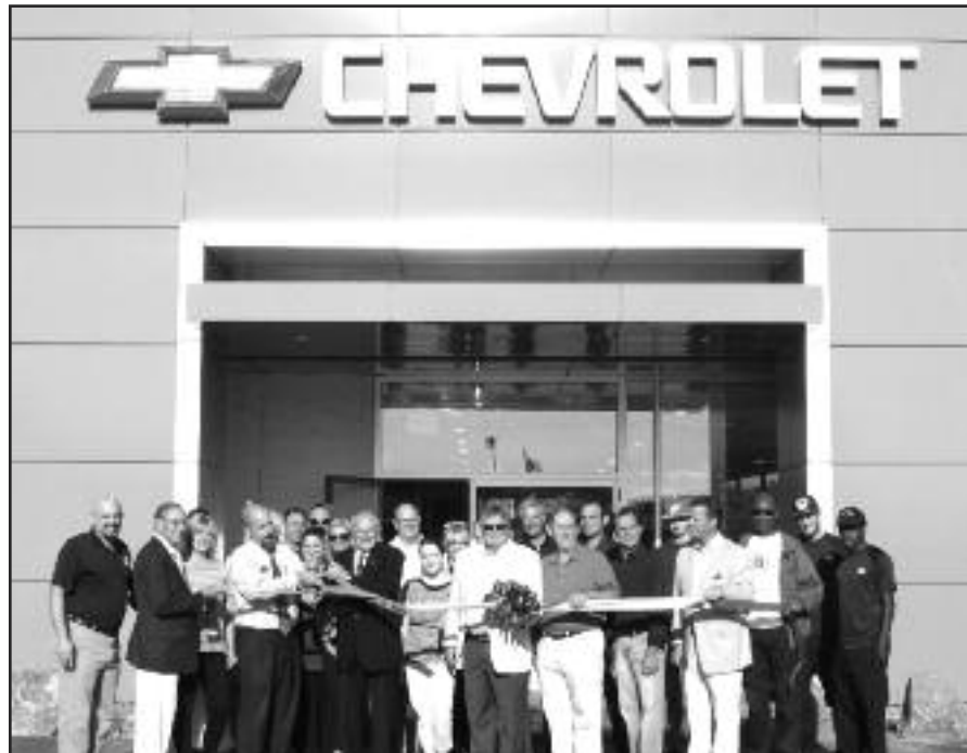
City officials and the staff at Mark Chevrolet celebrate the completion of the renovations with a ribbon cutting celebration.

The 24th Annual Red October Run sponsored by Oakwood Healthcare System will be Oct. 4. Events include a 10K Run, 5K Run, 5K Walk and a 1 Mile Jr. October. The run is an all ages event designed to encourage family fitness. Events will start at Oakwood Wayne on Annapolis just