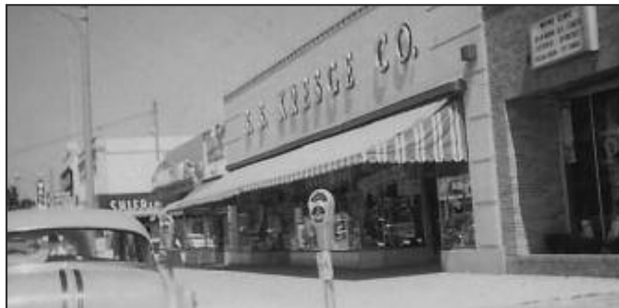
Kresge was a staple to residents of Wayne and the surrounding communities. Wayne residents enjoyed walking downtown and stopping by for a treat at the soda counter.

One of our favorite stops was the S. S. Kresge 5 and 10 cent store on the north side of Michigan Ave. at Wayne Rd. (Today the building houses a thrift shop and Kick's Tae Kwan Do business.) I remember spending lots of time wandering the aisles of Kresge's looking at all the things you could buy. In the back of the building you could look at the birds in the cages and the turtles and fish in the tanks. One aisle was filled with counters full of candy you could buy by the ounce or pound. There were all kinds of clothing for infants, children and adults. Some aisles had material and sewing supplies and others had yarn and threads for knitting and crocheting.