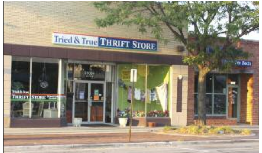
Tried and True Thrift Store offers a variety of deals and bargains from clothes and household items to movies, cds and toys.

The City of Wayne and their citizens have been great supporters of the Tried & True Thrift Store. Donations of gently used clothing, household items, sporting equipment and more come in on a daily basis. Customers have found great items at