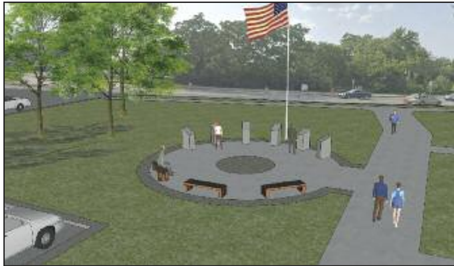
Rendering of the Veterans Memorial project for Goudy Park.

The Wayne Veterans Memorial will be, according to a handout from the City, "a lasting tribute for the many veterans who served their country. Many of these brave souls